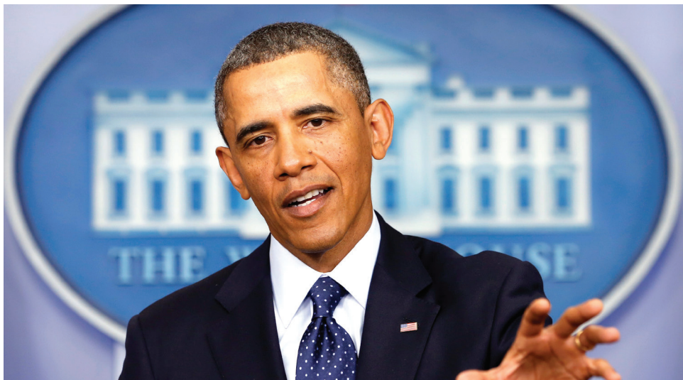
U.S. President Barack Obama