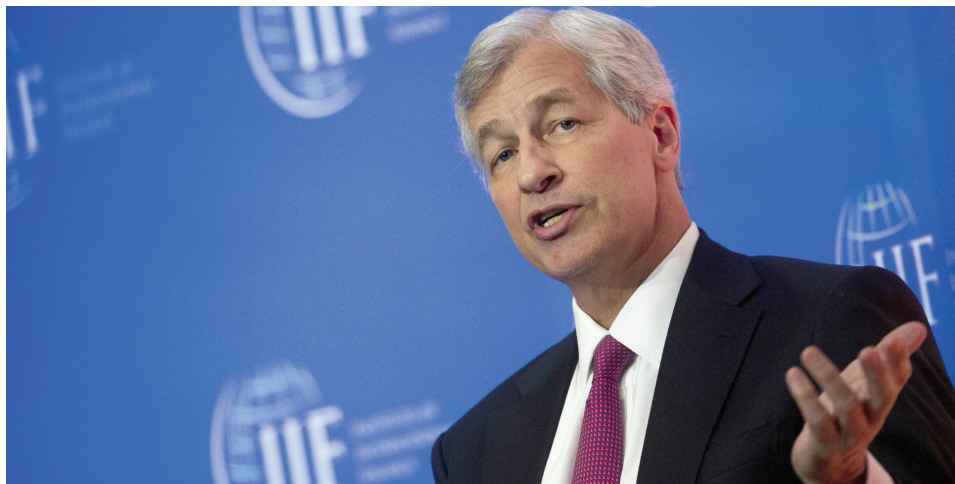
Jamie Dimon, chairman and CEO of JPMorgan Chase

In addition to their banking services Chase funds innovative approaches and organizations that help small businesses become more successful. In 2014, for example, they launched Small Business Forward, a $30 million, five-year initiative to support the nonprofits that help grow clusters of small businesses, while also supporting entrepreneurs and catalyzing small business development. As part of that initiative, they provided grants to 13 sector-focused small business clusters in the United States and Europe. And through Chase's Mission Main Street Grants program, they awarded $3 million to 20 small businesses around the U.S. that make a positive impact in their respective