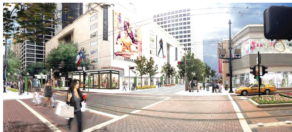
The Downtown Houston Task Force recommends that Dallas Street between Milam and La Branch serve as downtown's shopping district.