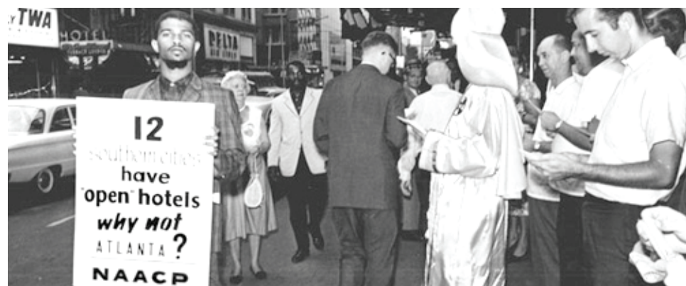
Image on the left: Photograph of demonstration against segregated hotels, Atlanta Journal-Constitution, July 4, 1962.

The history of the industry that provides sleeping quarters is not totally devoid of Black Hotel Owners. Black-owned and operated hotels have existed since pre-turn of the century.